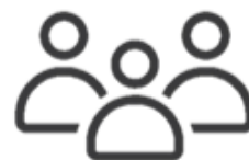
Helpdesk Support from our team

Fully approved EMV testing for all the major payment brands: