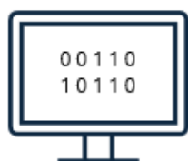
10 x EMV Profiles

Please note that card profiles are subject to expiry and must be repurchased when they expire, as expired profiles are not automatically renewed or replaced.